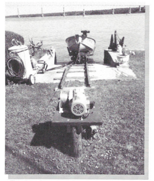
This photo shows a typical application using the Boat Ramp Winch. Please call our office toll-free to discuss your specific application.

Pulling Speed. Approximate pulling speed is 9 feet/minute on an empty drum. Pulling speed will increase as cable spools onto drum. (Larger capacity and custom winches are available on a review basis.)